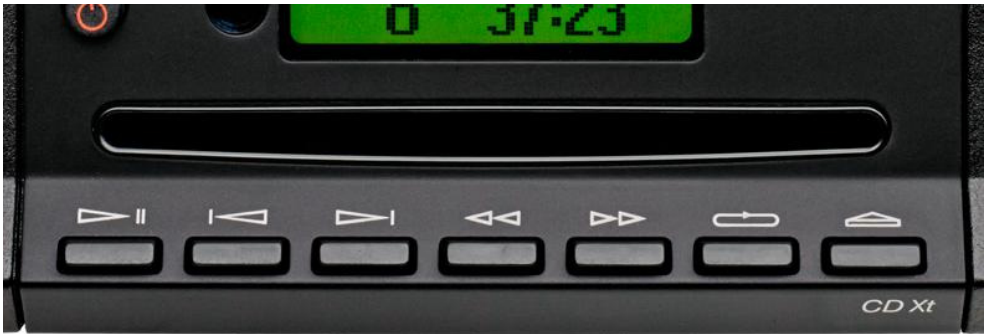
The CD Xt is built into Cyrus's traditional half-width casing

The Signature is built neatly, mirroring the construction of other Cyrus products (http://www.whathifi.com/products/cyrus) . It doesn't give off a premium aura, though, which is what we'd hope for at this price.